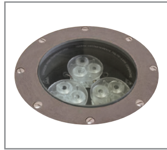
Model: Big Bopper Finish: Composite Bronze