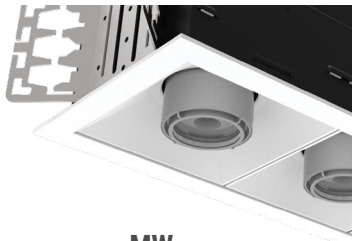
MW matte white