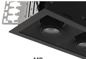
MB matte black