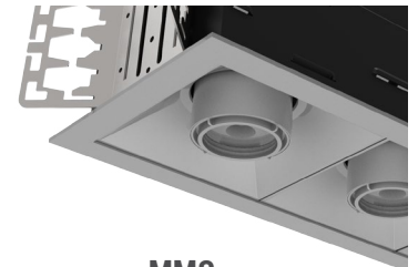
MMS matte metallic silver