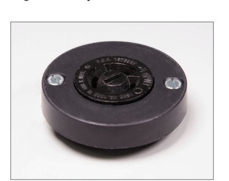
3 or 7-PIN NEMA Receptacle