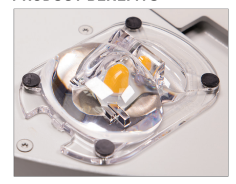
High Efficiency LEDs