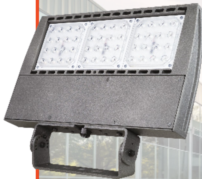
GFLD Galleon II Floodlight

Eight flood optics for precision control, from an IES NEMA 1x1 with a 10° beam spread up to an asymmetric 7x6