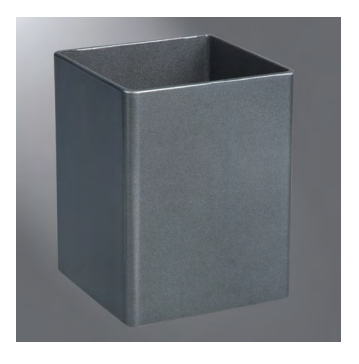
STS SQUARE TAPERED STEEL