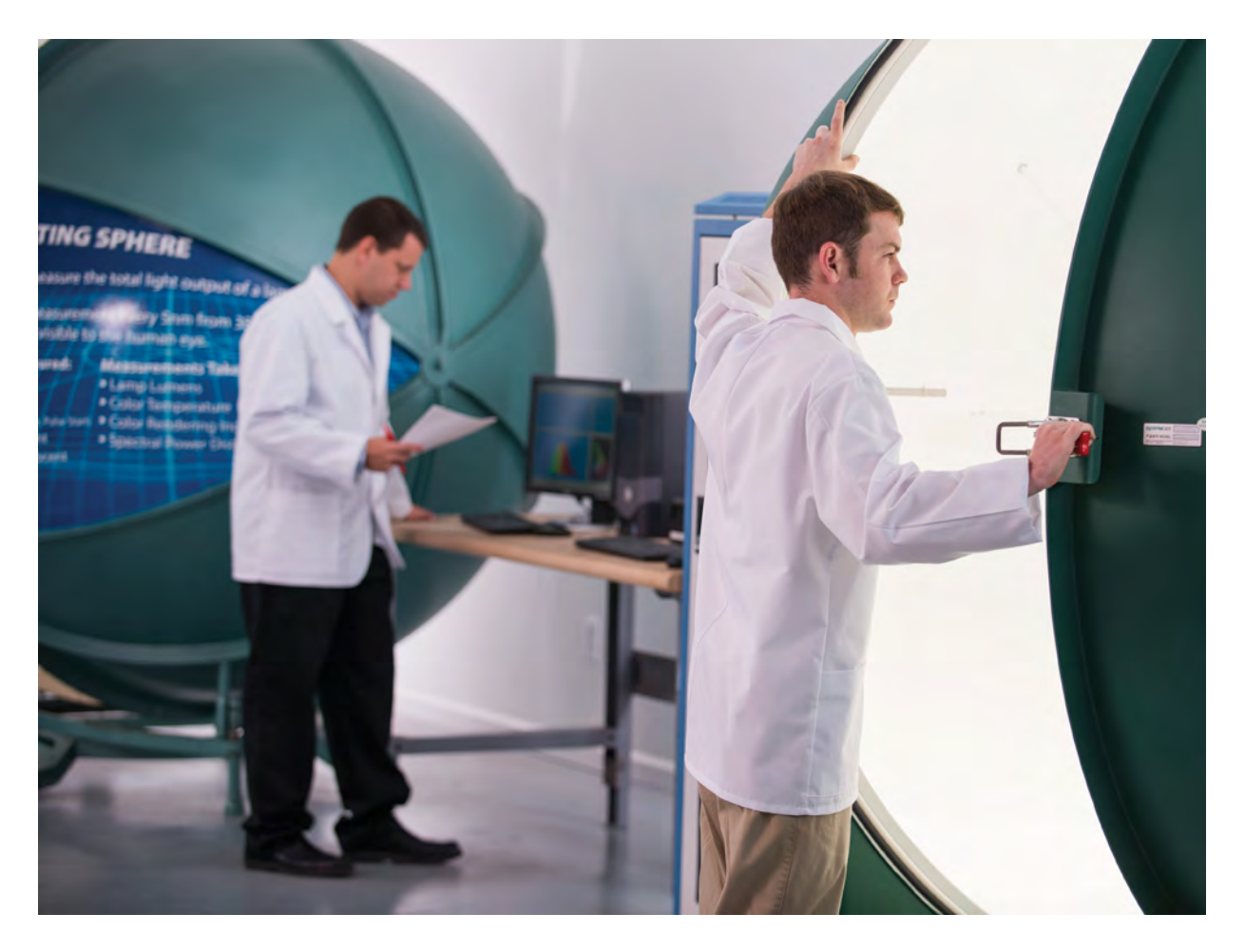
Designed, Engineered, Manufactured & Tested in the U.S.A.