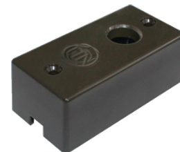
Optional Base AX1ABSE 2" x 4" x 1.5"

650 Algonquin Rd, Ste 206, Schaumburg, IL 60176 PH: 847.496.5276 FAX: 846.701.8342