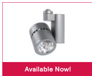
Alcyon Vertical Track Heads