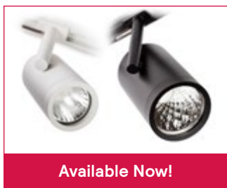
OmniSpot Track Heads