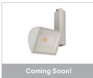
BoldFlood Track Heads