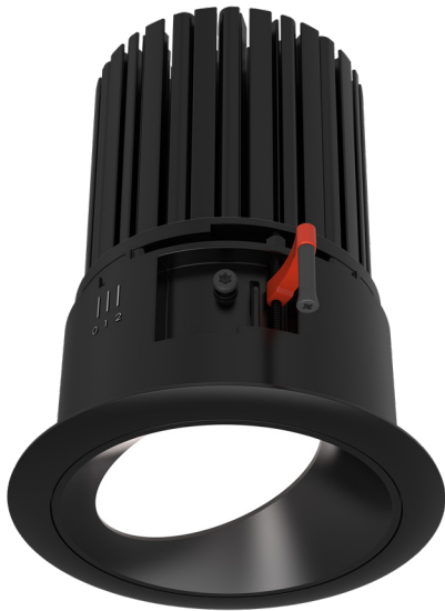
Image Above Shown With Deep Smooth Black Baffle and Black Trim Ring