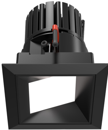
Image Above Shown With Deep Smooth Black Baffle and Black Trim Ring

The LaYR recessed wall wash downlights are designed to offer high performance and enhance interior environments with exceptional optical performance, comfort, and industry-leading wall wash capability. They are carefully engineered to ensure effective and uniform illumination across vertical surfaces like walls, resulting in a visually pleasing atmosphere. This makes them a great choice for applications where highlighting vertical elements or creating a specific ambiance is important. Whether it's in retail spaces, museums, galleries, hospitality venues, residential settings, or commercial buildings, these downlights are designed to deliver reliable and visually impressive lighting solutions.