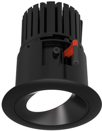
Image Above Shown With Deep Smooth Black Baffle and Black Trim Ring