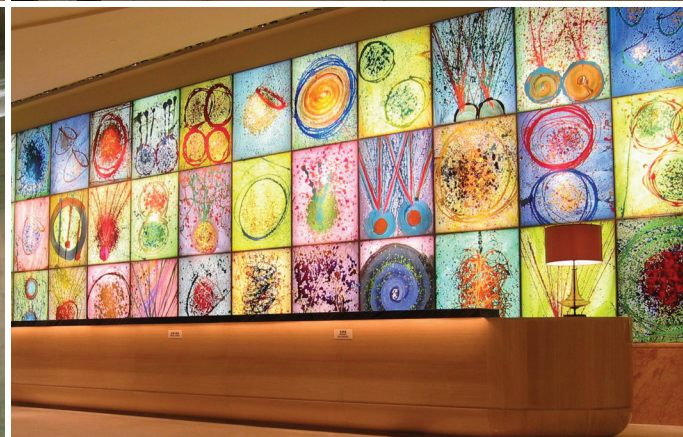
▲ Barrier Residence Designer: Studio Lux