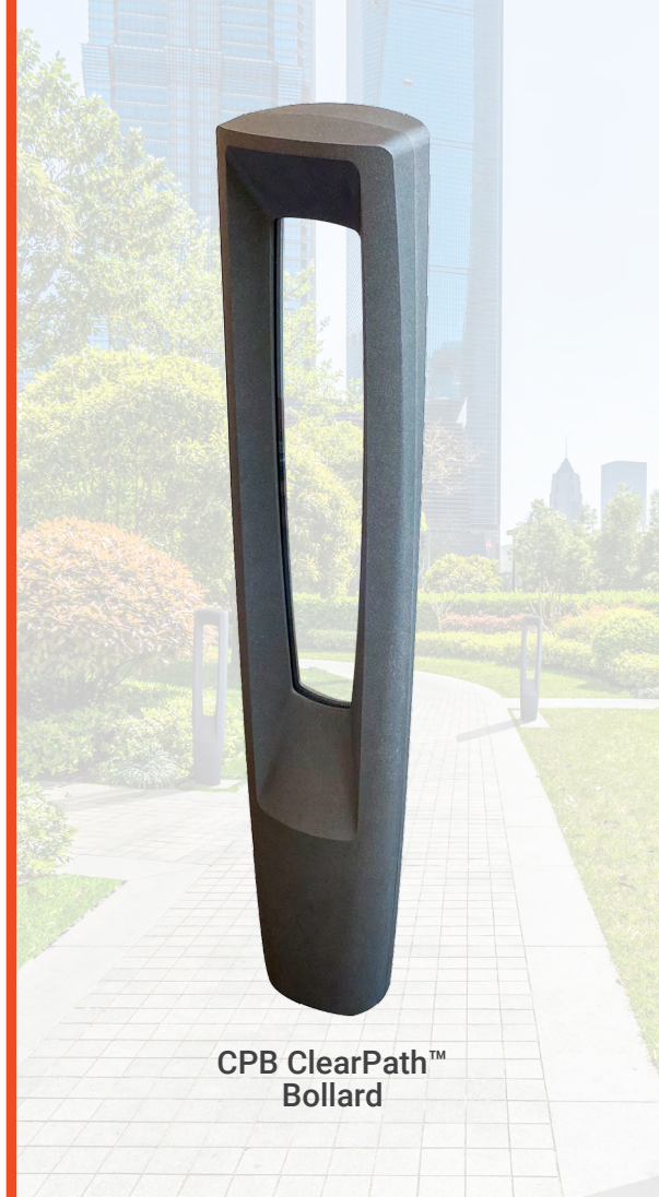
CPB ClearPath™ Bollard