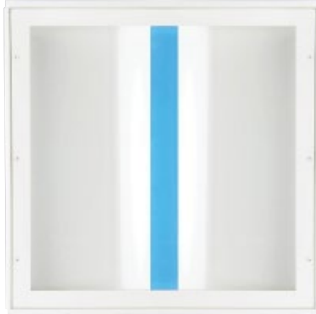
STRM/BL = Medium Stripe, Blue BL=BLUE BK=BLACK RD=RED