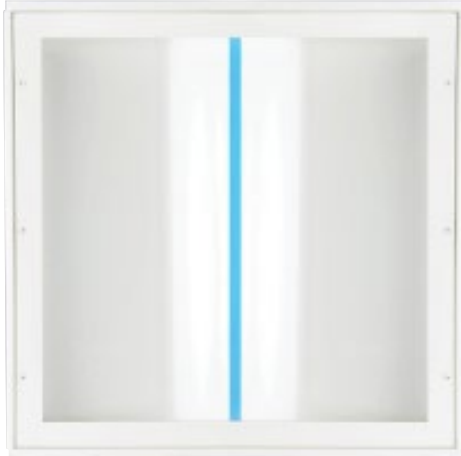
STRT/BL = Thin Stripe, Blue BL=BLUE BK=BLACK RD=RED