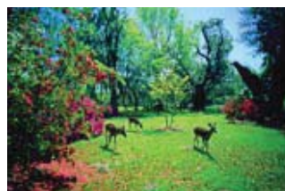
NSC2 wall: 36, 46, 243, 244