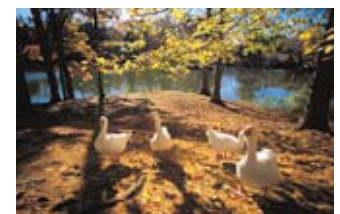
SP222 wall: 36, 46, 243, 244