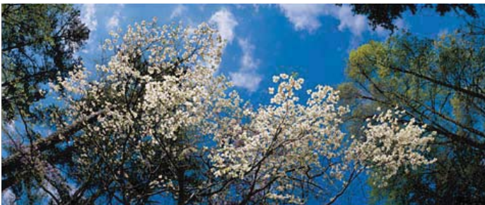
NO9698 ceiling: 2B, 4A, 4D, 4E, 4F