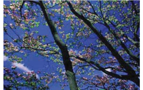
ASP7389 ceiling: 2A, 2B, 2C, 2D, 2E, 2F 4B, 4C, 4G