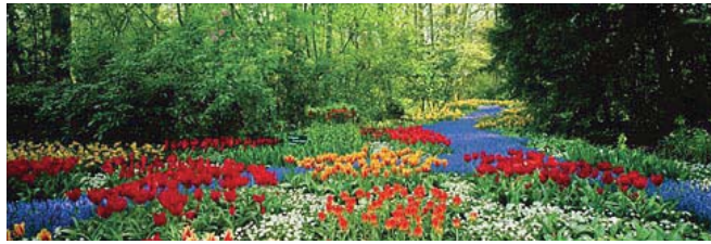
GXK14 ceiling: 4A, 4D, 4E, 4F wall: 244, 96, 120, 144