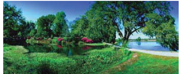
SCN9 wall: 96, 120, 144, 244