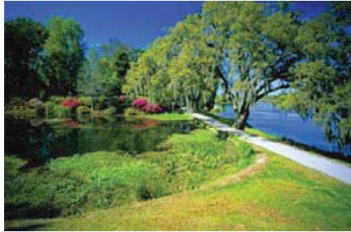
NSC13 wall: 36, 46, 243, 244