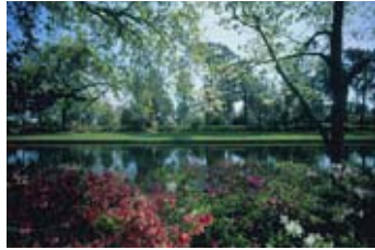
CHSP1 wall: 36, 46, 243, 244