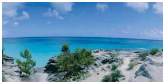
SCNB5 wall: 96, 120, 144