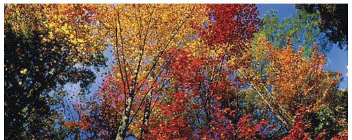
WLFL400 ceiling: 4A, 4D, 4E, 4F