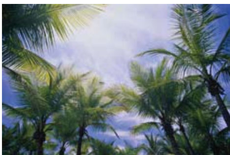
SCPR9034 ceiling: 2A, 2B, 2C, 2D, 2E, 2F 4A, 4B, 4C