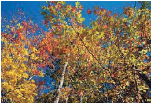
NO3999 ceiling: 2A, 2B, 2C, 2D, 2E 4A, 4B, 4C, 4G