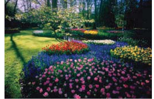
NSNK25 ceiling: 2A, 2B, 2C, 2F, 4A, 4B, 4C, 4G