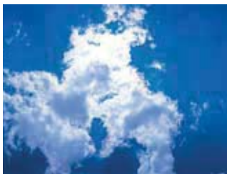
CL9 ceiling: 2A, 2B, 2C, 2D, 2E 4A, 4B, 4C, 4G