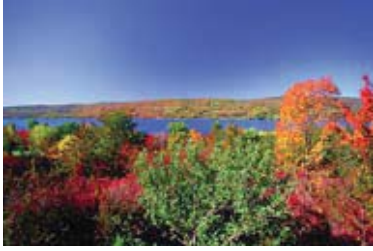
SFL30 wall: 36, 46, 243, 244