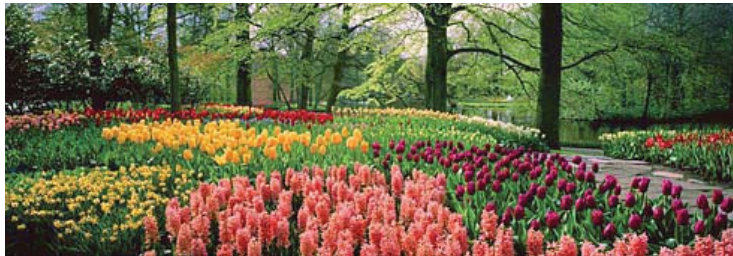
GXK3 wall: 96, 120, 144