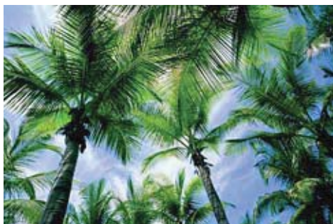
SCPR9035 ceiling: 2B, 2C, 2D, 2E, 2F 4A, 4B, 4C, 4D, 4G