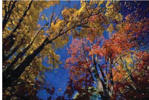
SM4 ceiling: 2A, 2B, 2C, 2D, 2E 4A, 4B, 4C, 4G