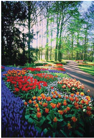
NSNK61 - Vertical ceiling: 2A, 2B, 2C, 2D, 2E, 2F 4A, 4B, 4C, 4G