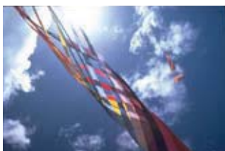
AA4705 ceiling: 2A, 2B, 2C, 2D, 2E, 2F 4B, 4C, 4D