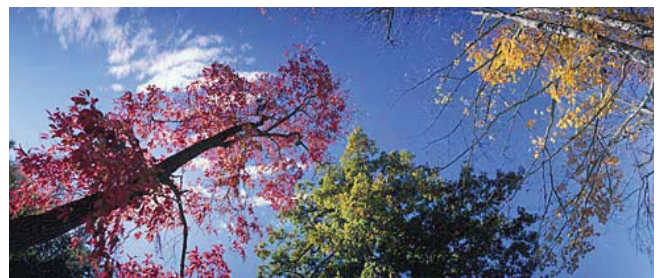
FNO1 ceiling: 4A, 4D, 4E, 4F, 2B