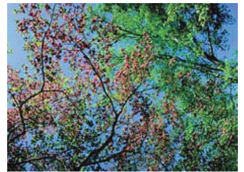
WNSPO205 ceiling: 2A, 2B, 2C, 2D, 2E 4A, 4B, 4C, 4G