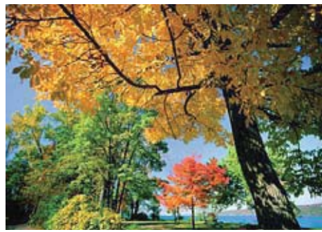
SFL10 ceiling: 2A, 2B, 2C, 2D, 2E, 2F 4A, 4B, 4C, 4G wall: 244, 24, 36, 46, 248