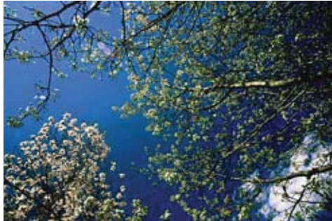
ASP3940 ceiling: 2A, 2B, 2C, 2D, 2E 4A, 4B, 4C, 4G