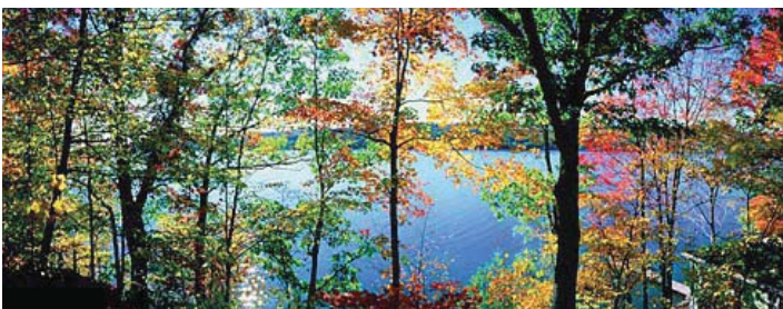
WLFL990 wall: 96, 120, 144