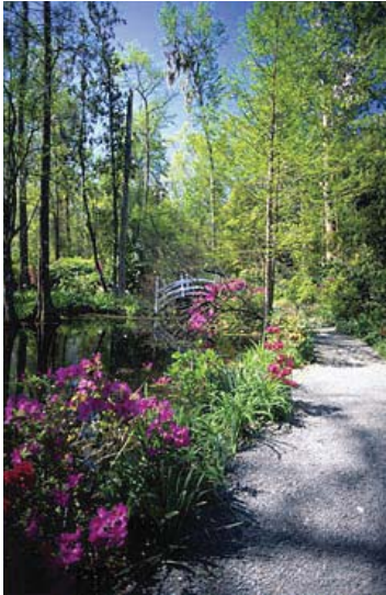
ASP2012 - Vertical ceiling: 2B, 2D, 4A, 4C wall: 36, 46, 243, 244