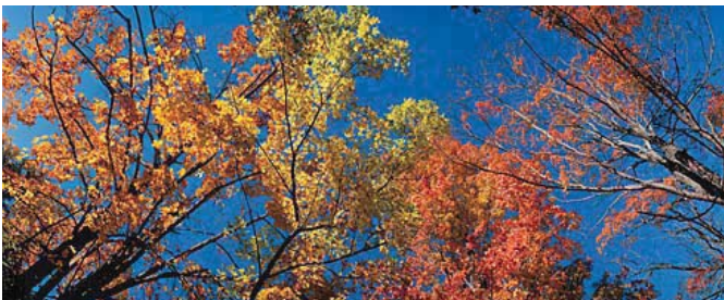
FNO6768 ceiling: 4A, 4D, 4E, 4F, 2B