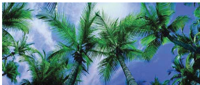
SCNPR702 ceiling: 2B, 4A, 4D, 4E, 4F