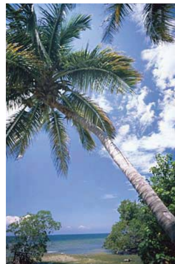
SCPR9057 - Vertical ceiling: 2B, 2D, 4A, 4C wall: 34, 46, 244