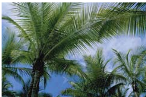
SCNPR700 ceiling: 2A, 2B, 2C, 2D, 2E, 2F, 4A, 4C, 4E, 4G