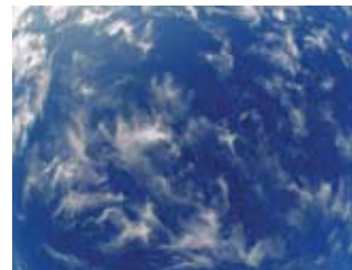
CL8 ceiling: 2A, 2B, 2C, 2D, 2E 4A, 4B, 4C, 4G