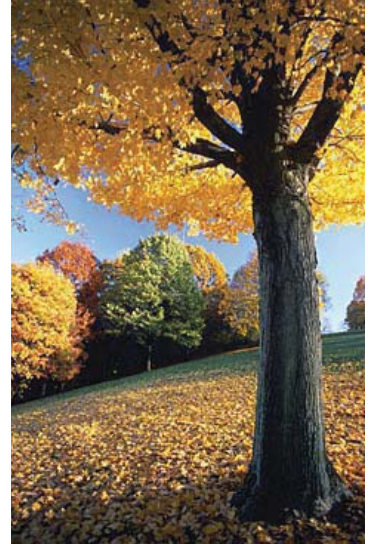
SFL36 - Vertical wall: 36, 46, 244