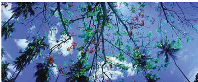
SCNPR9000 ceiling: 2B, 4A, 4D, 4E, 4F