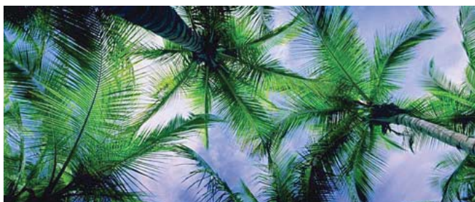
SCNPR704 ceiling: 2B, 4A, 4D, 4E, 4F