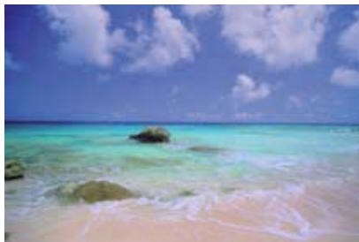
SCB006 wall: 36, 46, 243, 244, 248