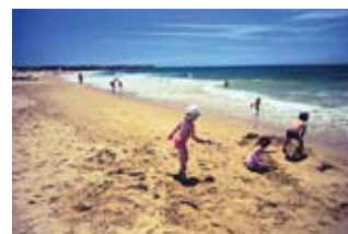
SP9975 wall: 36, 46, 243, 244