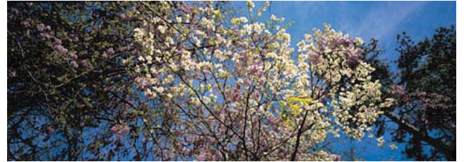
XPS2 ceiling: 2B, 4A, 4D, 4E, 4F