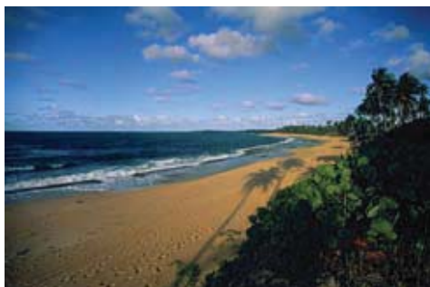
SCPR613 wall: 36, 46, 243, 244, 248