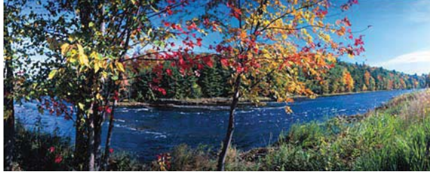
WL8687 wall: 96, 120, 144