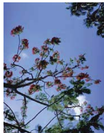
SCNPR9003 - Vertical ceiling: 2C, 2E, 4B, 4G