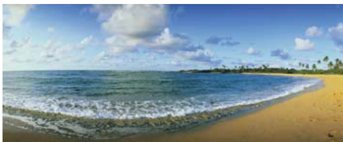
SCNPR111 wall: 96, 120, 144