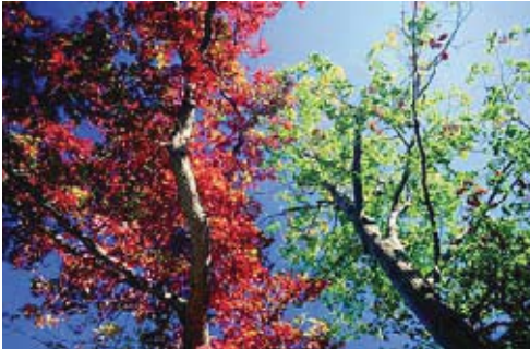
SFL38 ceiling: 2A, 2B, 2C, 2D, 2E, 2F 4A, 4B, 4C, 4G