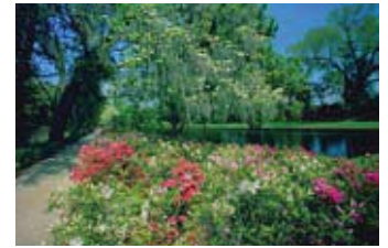
CHSP4 wall: 36, 46, 243, 244