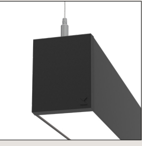
Aircraft Cable Aircraft cable suspension lengths are adjustable.