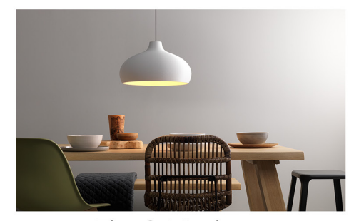
The Original one

The family is composed for three stylish light pendants all customizable and available in medium and large sizes.