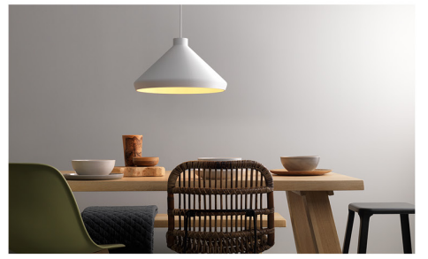
The Original two