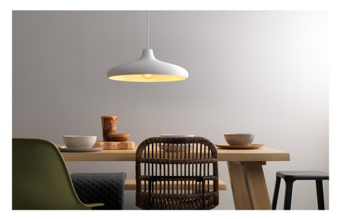
The Original three