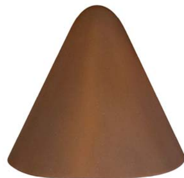
SHOWN IN ANTIQUE FINISH