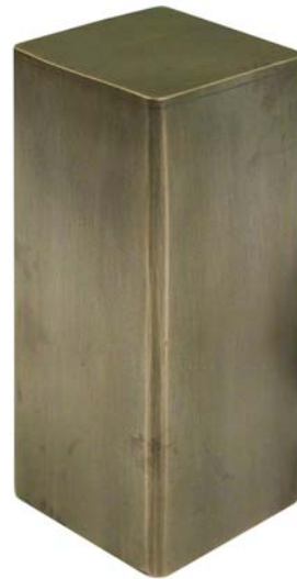
SHOWN IN ANTIQUE FINISH