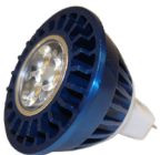
SLMR164XXW27 SLMR164XW27 SLMR164W27 SLMR164M27 SLMR164N27