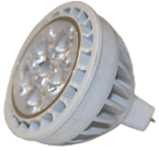
SLMR166XXW27 SLMR166XW27 SLMR166W27 SLMR166M27 SLMR166N27