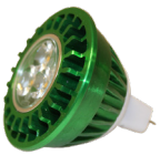
SLMR162XXW27 SLMR162XW27 SLMR162W27 SLMR162M27 SLMR162N27