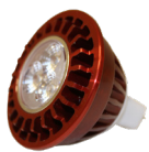
SLMR161XXW27 SLMR161XW27 SLMR161W27