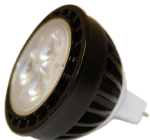
SLMR165XXW27 SLMR165XW27 SLMR165W27 SLMR165M27 SLMR165N27