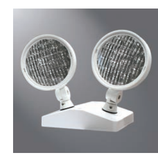
RF LED - REMOTE