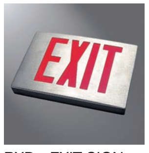
RXD - EXIT SIGN