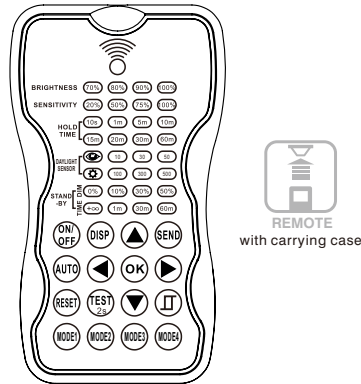
REMOTE with carrying case