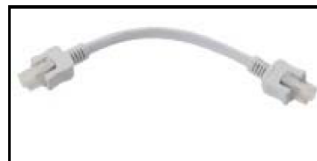
6" Joiner Cable