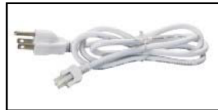
39" Power Cord