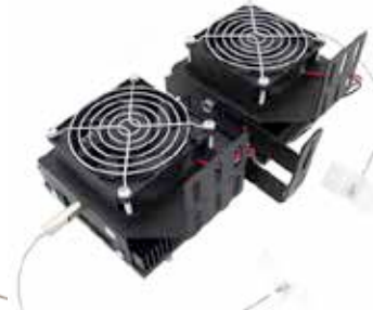
LHER Back - Horizontal