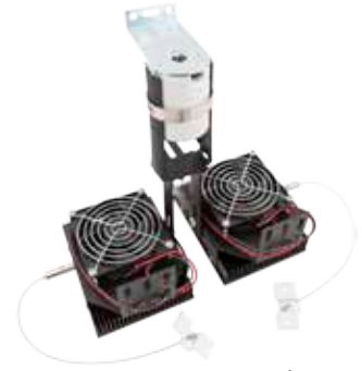
LHER Vertical FlexMount to Mogul