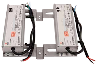
LHER Dual Drivers