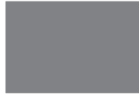
GY3TX Textured Medium Grey