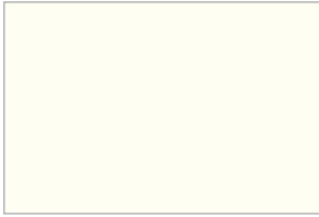
WHTX Textured White