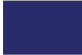
BE6TX Textured Ocean Blue