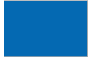
BE8TX Textured Royal Blue