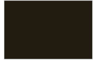
BRTX Textured Bronze