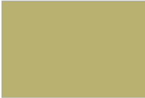
BG2TX Textured Sandstone