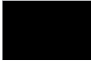
BKTX Textured Black