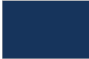
BE2TX Textured Midnight Blue