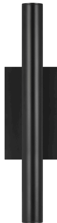
CHARA 17 OUTDOOR WALL shown in black