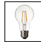
SPJ-A19 12V 2W or 4W

Unlimited LED Lumen Packages & Color Temperatures Available!