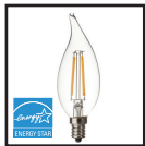
SPJ-2W-CB-C 2W 12V or 120V

Unlimited LED Lumen Packages & Color Temperatures Available!