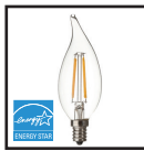
SPJ-2W-CB-C 2W 12V or 120V

Unlimited LED Lumen Packages & Color Temperatures Available!