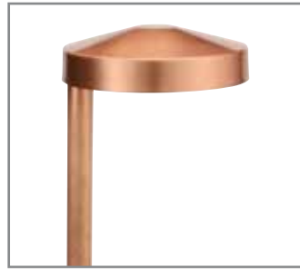
Model: SPJ11-05 Finish: Raw Copper