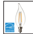
SPJ-2W-CB-C 2W 12V or 120V

Unlimited LED Lumen Packages & Color Temperatures Available!