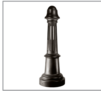
Model: SPJ-GDG-37 Finish: Powder Coat Black