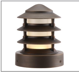
Model: SPJ-FB-PH4 Finish: Matte Bronze