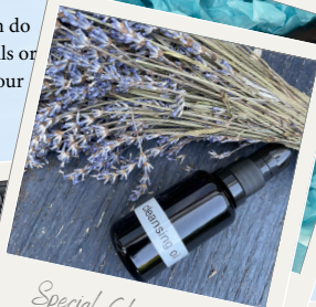
Special Cleansing Oil

With 30 plus years of experience I can do this with minimal fuss. Just a few emails or a phone call will allow me to make your blend within a couple of days.