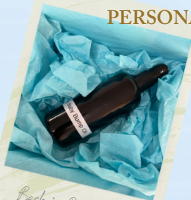
Becky's Baby Bump