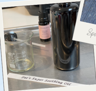
Sue's Super Soothing Oil