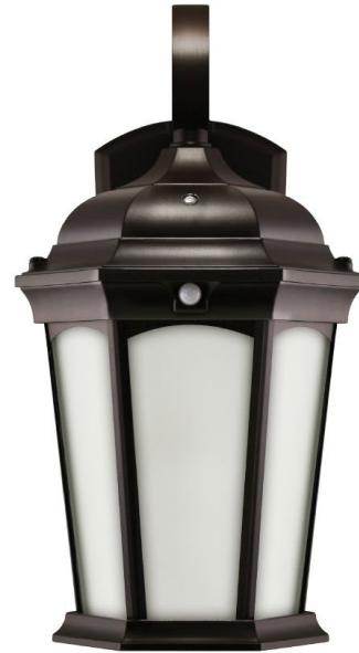
Integrated LED Fixture

*Note: Design, features and specifications subject to change without notice. Some features may not be available on all models. For more information please visit: www.eurilighting.com or call 1-888-743-5766