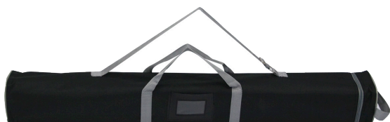
Econo Travel Bag ( 26" x 4" x 4" / 35.5" x 4" x 4" / 37.5" 4" x 4" )