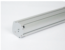
Silver (24" & 33.5" & 36")