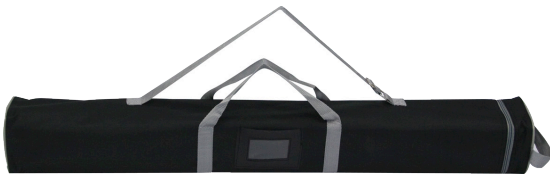
Econo Travel Bag ( 26" x 4" x 4" / 35.5" x 4" x 4" / 37.5" 4" x 4" )