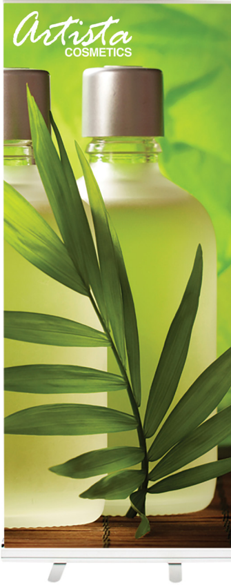
Silver Econo Roll