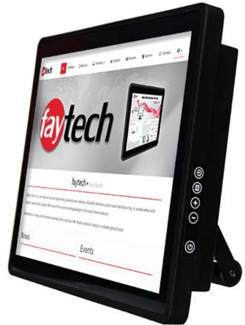
* Small Metal Stand Included in the Delivery

For industrial and business applications, faytech's Touch PC series provide incredible stability due to its fanless silent operation, no moving parts design and aluminum housing.