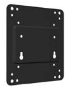
WALL Mount + VESA