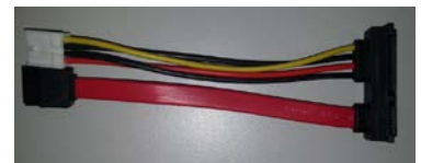
SATA + POWER CABLE