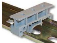
Din Rail Clip