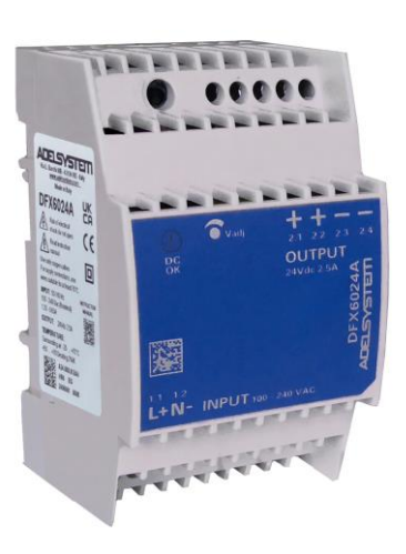
61 x 55 x 90 mm