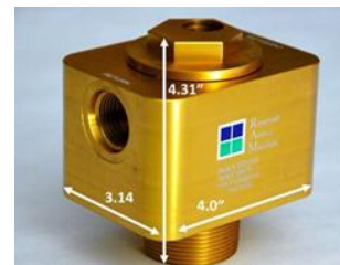
1", 1-1/4", 1-1/2"