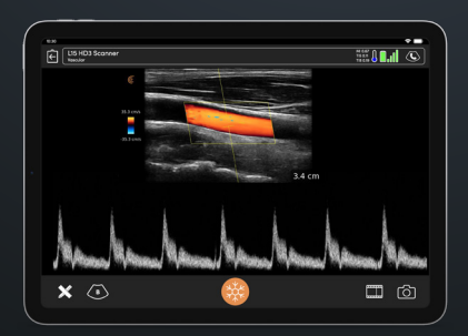
Pulsed Wave Doppler

Take full advantage of our 192 piezoelectric crystals and octal beamforming technology to power imaging modes never before seen in handheld ultrasound. Get the clinical insights you need without the complexity of a large system.