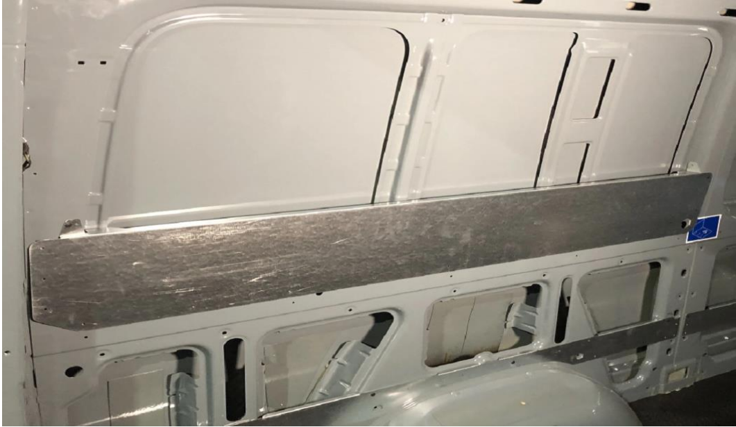
Example of Bed Height For 36" Height: