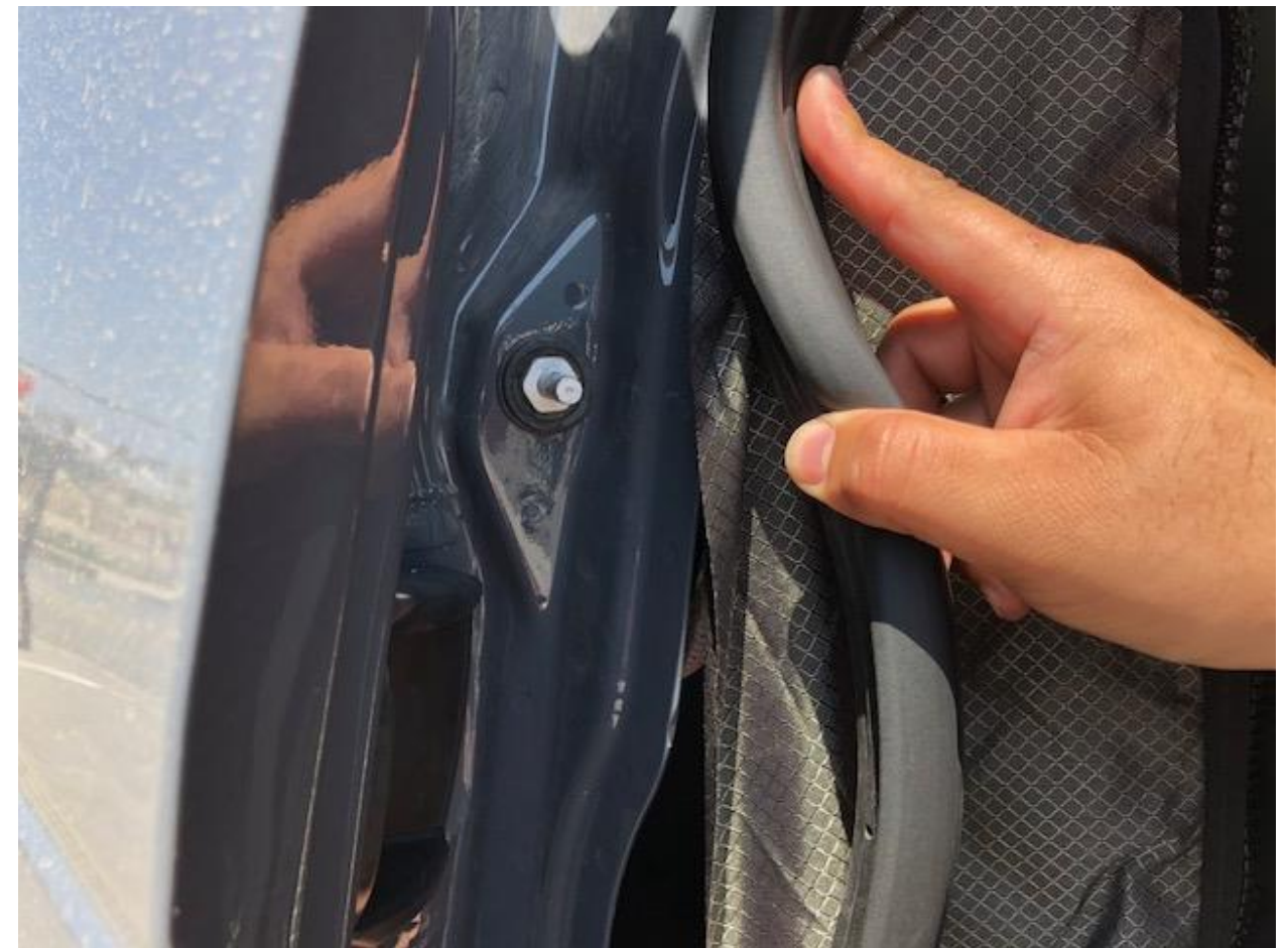
Page | 7