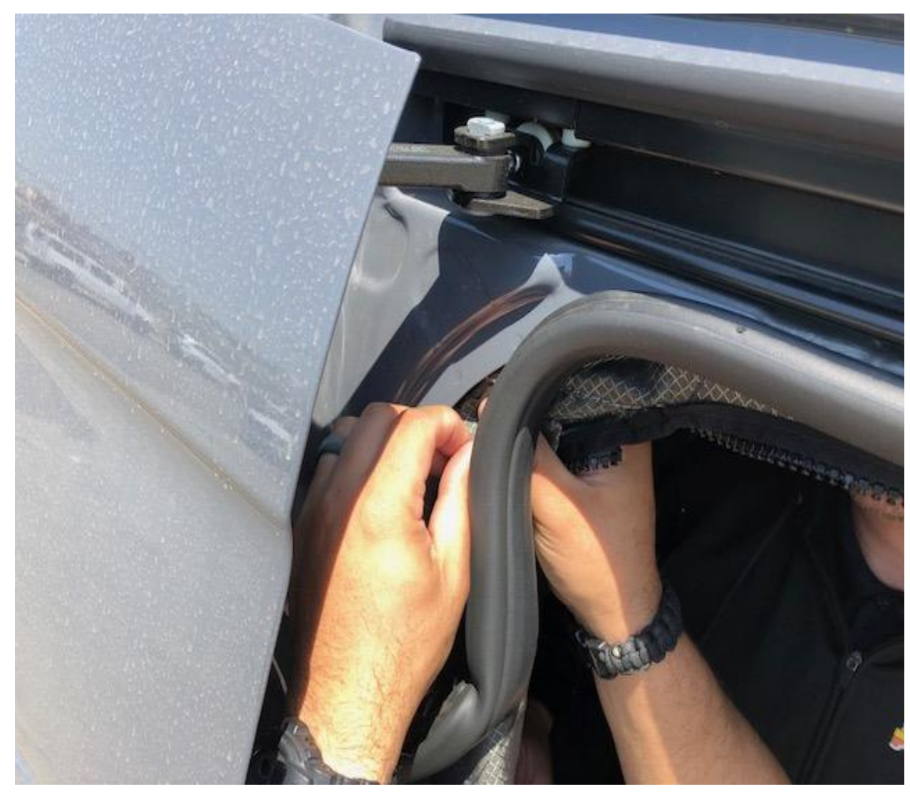
Page | 6