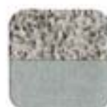
Slate Gray Counter with Granite Gray Base (671)