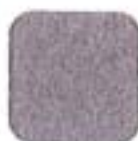
Granite Gray (191)