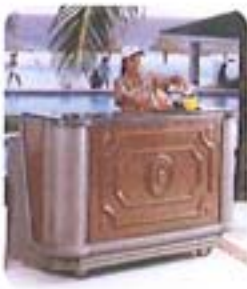
BAR730 shown in Carmel Designer Decor Package