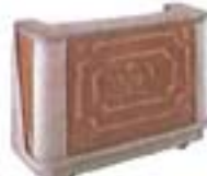
SEDONA (668) Granite Sand Base, Cocoa Countertop with Light Burlwood Panels

BAR650 and BAR730 Speed Rail Colors: Black (110) Gray Marble (188) Brown Mahogany (189) Granite Gray (191) Granite Sand (194)