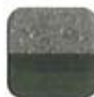
Granite Gray w/ Black Base (120)