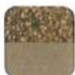
Cocoa Counter with Granite Sand Base (672)