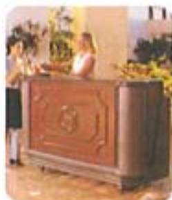
BAR730 shown in Sedona Designer Decor Package