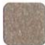
Granite Sand (194)