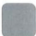
Slate Blue (401)