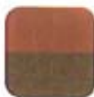
Two-tone Brown Mahogany (185)