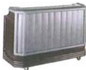
LARGE MODEL BAR730