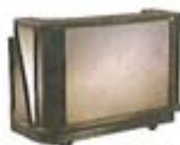
CHICAGO (770) Black Base, Coal Countertop with smooth Brushed Pewter Panels