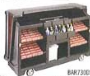
BAR730DS (shown with four optional wire racks)