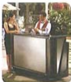
BAR650 shown in Chicago Designer Decor Package