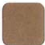
Dark Brown (131)