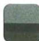
Granite Green w/ Black Base (471)