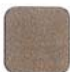
Granite Sand (194)