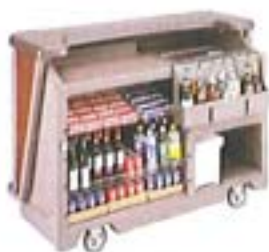
BAR650DS shown with two optional wire racks.