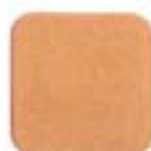
Coffee Beige (157)