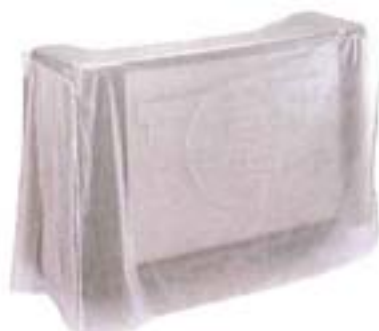
Vinyl cover included with all CamBars. Cover not NSF listed.