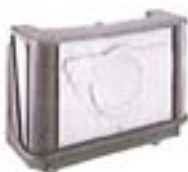
MANHATTAN (667) Black Base, Coal Countertop with Brushed Pewter Panels