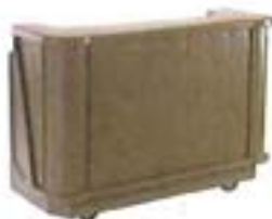
MID-SIZE MODEL BAR650