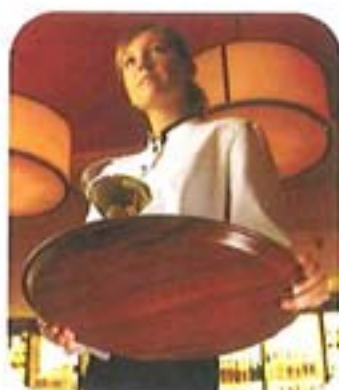
Camtread® Trays Designer Series