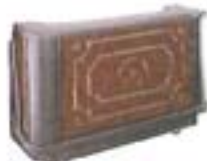
CARMEL (669) Black Base, Coal Countertop with Dark Burlwood Panels