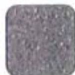
Granite Gray (191)