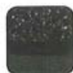
Coal Counter with Black Base (570)