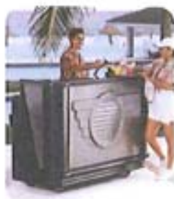
BAR650 shown in Manhattan Designer Decor Package