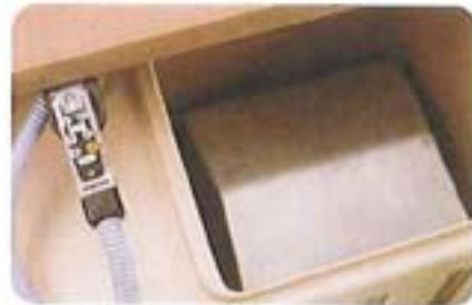
Standard equipment on PMT, PM and DL. Cold plate US patents 5,743,602 and 5,226,296.