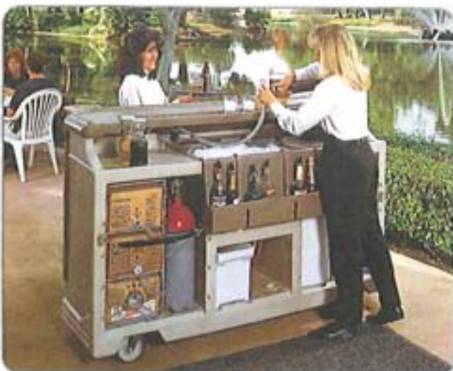
Excellent functionality speeds service.