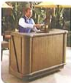
BAR650 shown in Standard Decor