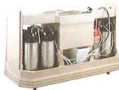
BAR730 with front panel removed