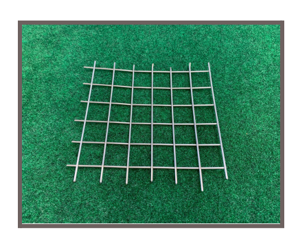
1"x 1" 16 gauge