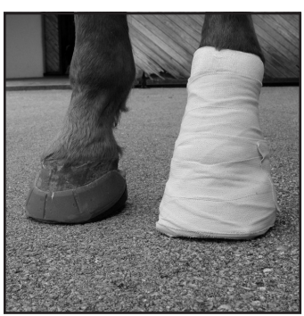
Ultimate Applied with Cotton Bandage