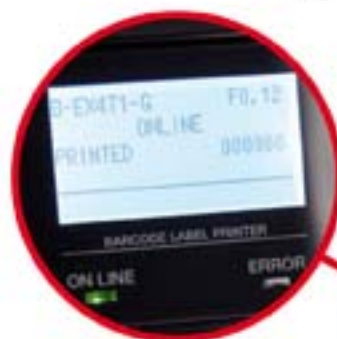
User-friendly front panel for easy operation and status reporting with helpdesk

Reliability and performance usually come at a cost but, with the B-EX series, premium capabilities come as standard, essentially lowering initial capital outlay and future-proofing your investment.