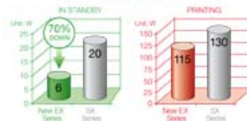
Power Usage (results based on 240V)

Toshiba technology has enabled a dramatic reduction in operating costs, further lowering an already legendary low 'total cost of ownership' (TCO). B-EX is equipped with the world-class green technology ribbon saving function (optional), with a nearly 70% overall lower power consumption on stand-by power compared to its predecessor. Ribbon wrinkle cancelling also reduces paper and ribbon wastage. These special features reduce operating costs whilst assisting environmental conservation.