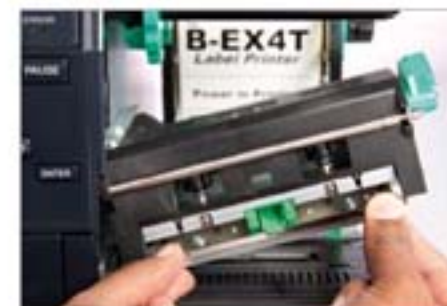
Snap-in printhead reduces maintenance downtime to a minimum

The unique intuitive graphical LCD 'helpdesk' display improves usability and prompts even the novice user to take immediate corrective action where necessary, keeping user training to a minimum.